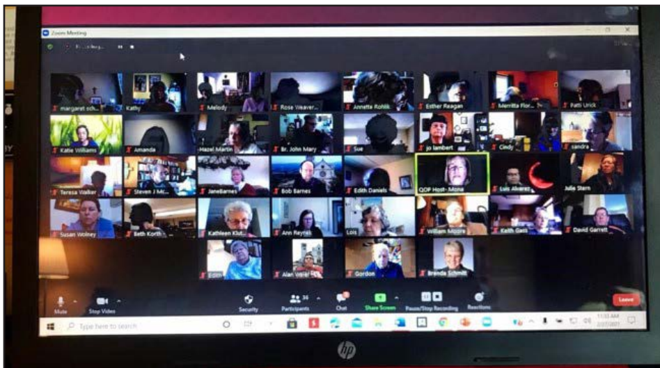
Queen of Peace Regional Formation Workshop, February 27, 021